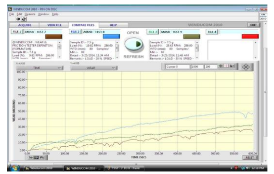
Fig.3 Wear rate graph for 5% of Reinforcement

The wear rate of the composite specimen increases with increasing sliding distance and load. The fig 3.graphs shows that the reinforced alloy specimen increases more rapidly with applied load compared with the composite specimen. The graph exhibit two regions which is 'running in' and 'steady state' periods. During running-in period the wear rate increased very rapidly with increasing sliding distance. During steady state period, the wear progressed at a slower rate and linearly with increasing sliding distance. The higher wear rate at the initial stage is due to the adhesive nature of the sample to the sliding disc. The results show that the particulate reinforcement B_4C and fly ash has a marked effect on the wear rate .The wear rate of the composite specimen decreases with the increasing weight percentage of particulate reinforcement.