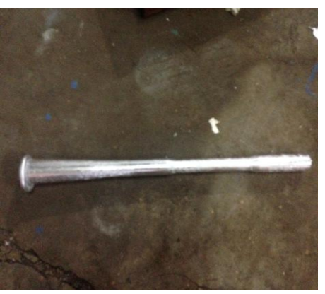
Fig 2.Fabricated work piece

• Wear studies of the composites leads to following discussions. Sample size was 240mm length and 20mm dia. fabricated work pieces are shown in Fig 2.