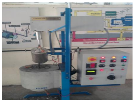
Fig.1 Experimental setup used for stir casting.

The composites were fabricated by stir casting method to ensure uniform distribution of the reinforcements. The LM 25 alloy, initially in the form of ingot, which was cut into small pieces then it is placed in the Teflon coated crucible, Aluminum alloy was first melted in an electric furnace. flyash and B_4C , pre heated to a temperature of about 600^{\circ}C , were added to the molten metal at 850^{\circ}C and stirred continuously. The stirring was carried out at 250 r/min for 10min. Then the preheated reinforcement was poured into a permanent metallic mold. Casting setup is presented in Fig.1